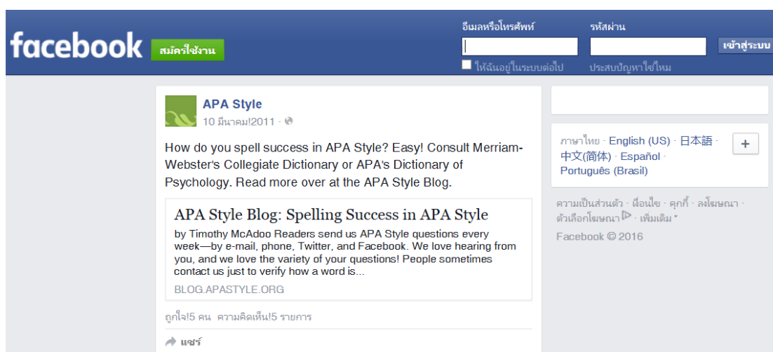
Figure 5.3 Example of Facebook Status Update of a Group

Example For a group APA Style. (2011, March 10). How do you spell success in APA Style? Easy! Consult Merriam-Webster's Collegiate Dictionary or APA's Dictionary of Psychology. Read more over at the APA Style Blog [Facebook status update]. Retrieved from https://www.facebook.com/APAStyle/posts/206877529328877 Citation (APA Style, 2011).