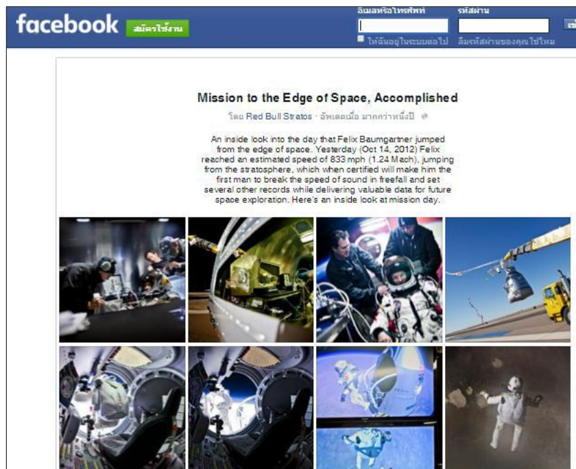
Figure 5.5 Photo Album Example