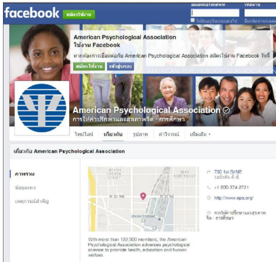
Figure 5.1 Example of Facebook Page